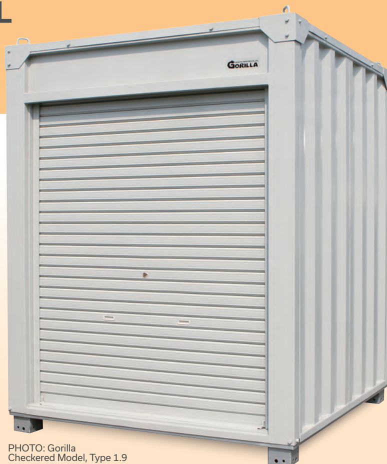
PHOTO: Gorilla Checkered Model, Type 1.9

※ Images are for illustrative purposes only.